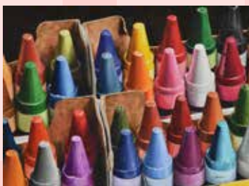
Box of Dreams Crayons - Lynn D. Pratt